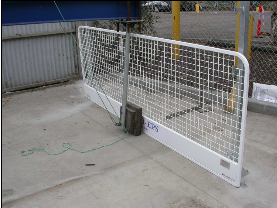
Figure: 1 Subject: General assembly of the panels (single only) ready for impact testing of the bottom section