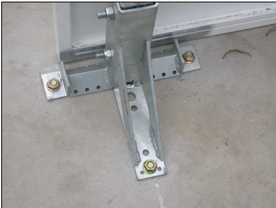
Figure: 2 Subject: Vertical post foot bolting configuration (NA007 modified)