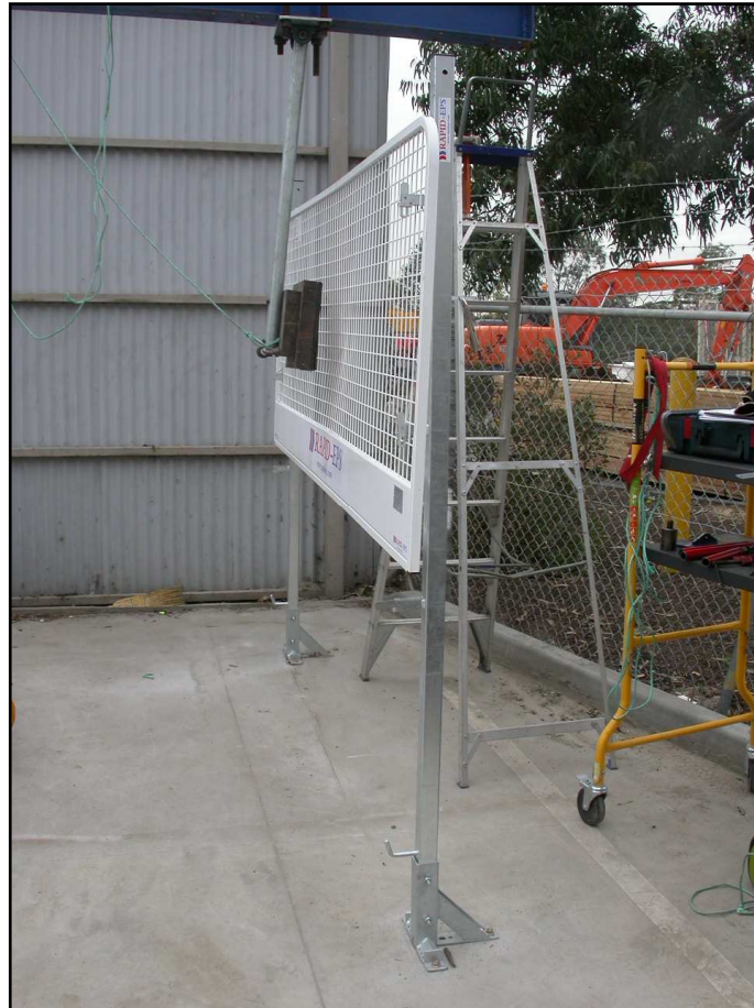
Figure: 3 Subject: Top panel ready for mid-point impact test